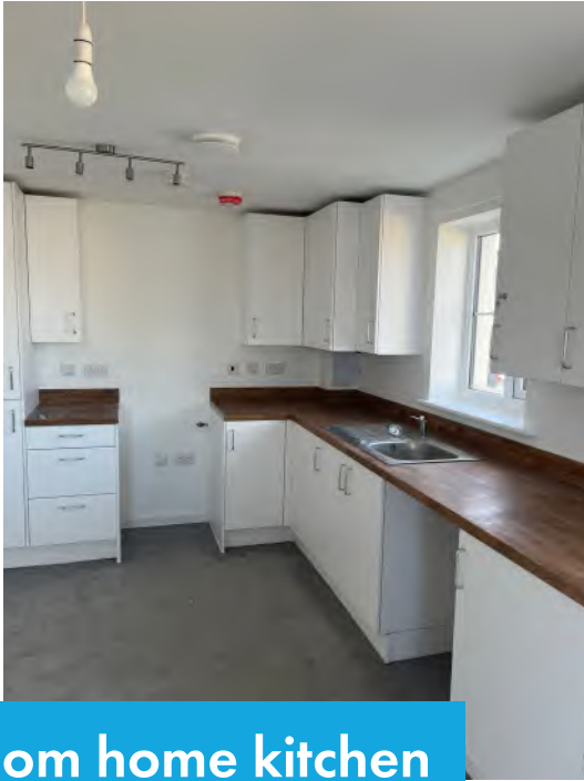
2 bedroom home kitchen