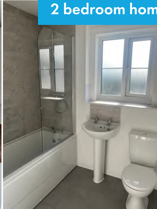
2 bedroom home bathroom