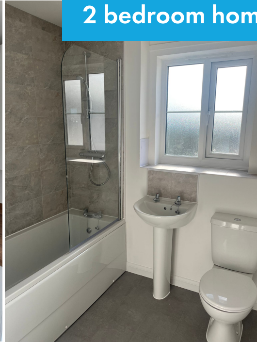
2 bedroom home bathroom