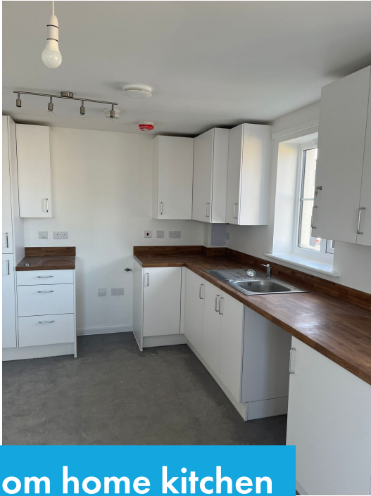
2 bedroom home kitchen