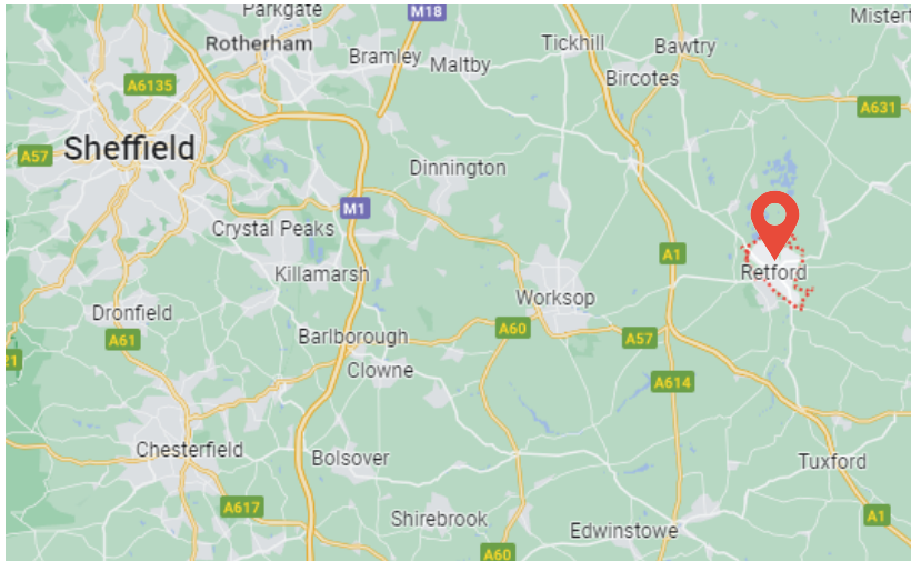
The Brambles, London Road, DD22 7JE

Retford is a market town, 42 km east of Sheffield 37km west of Lincoln and 50km north east of Nottingham. Working again with Harron Homes, Rentplus is delighted to offer new affordable rent to buy homes for the first time in Nottinghamshire.