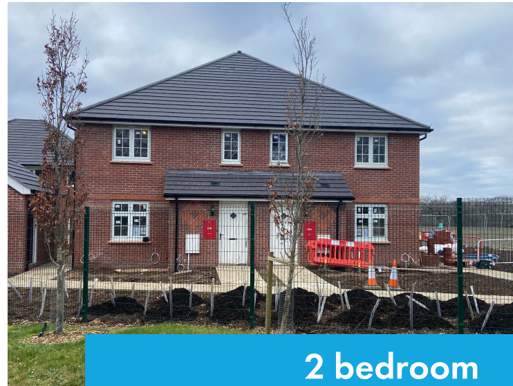
2 bedroom semi-detached home

* Applicants for the larger 2 bed house will need a minimum household income of £34,000pa