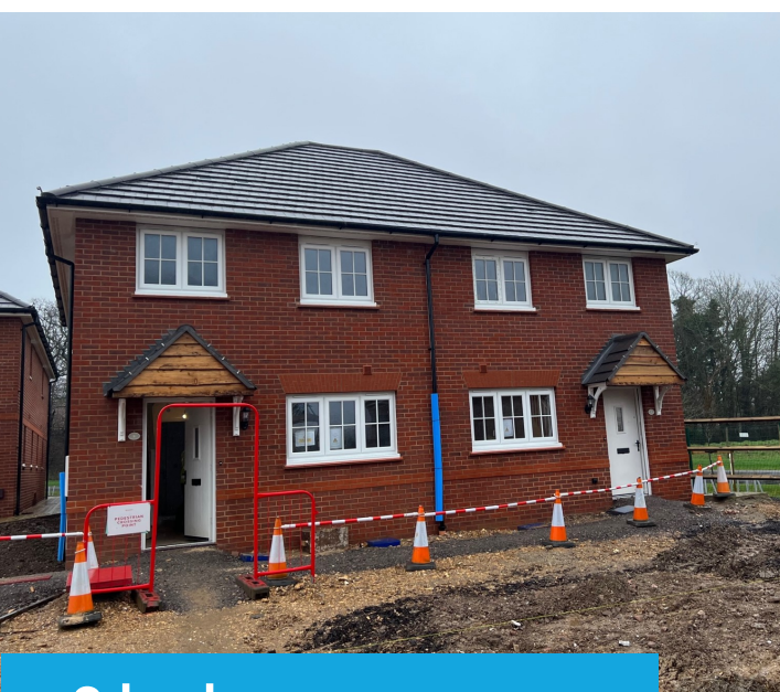
2 bedroom semi-detached home

Move in with £0 deposit. Tenants have an option to buy at agreed pre-determined points at years 5, 10, 15 and 20 of the tenancy and receive a 10% gifted deposit from Rentplus at point of purchase.