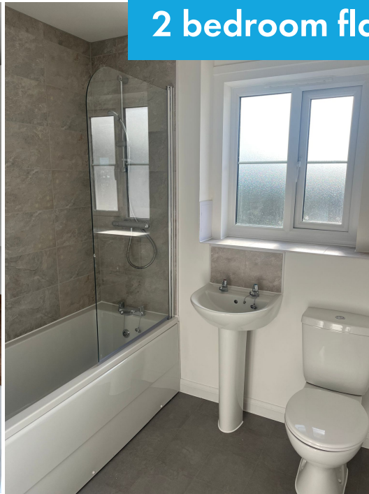
2 bedroom flat bathroom