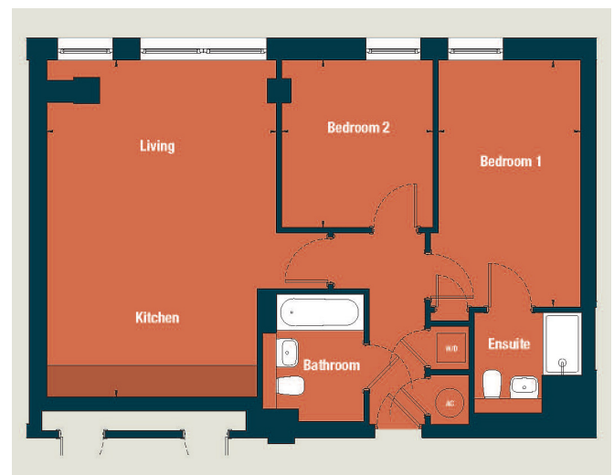
Two Bed Floorplan